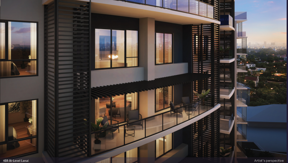
4BR Bi-Level Lanai